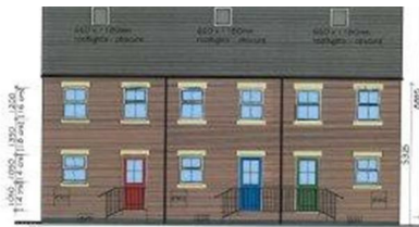
Front Elevation SCALE 1:50