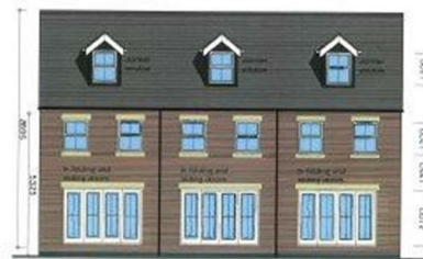
Rear Elevation SCALE 1:50