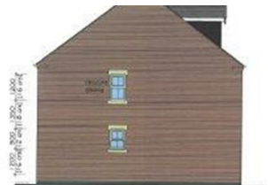
Side Elevation SCALE 1:50