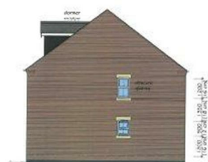
Other Side Elevation SCALE 1:50

St. Johns Street, Long Eaton, Nottingham NG10 1BW